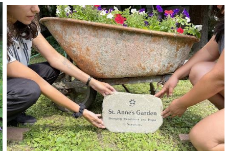
Images of Lifeway's safehouse, gardening/planting of survivors, and art projects of survivors