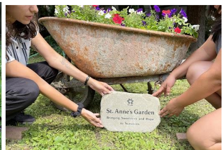
Images of Lifeway's safe house and garden