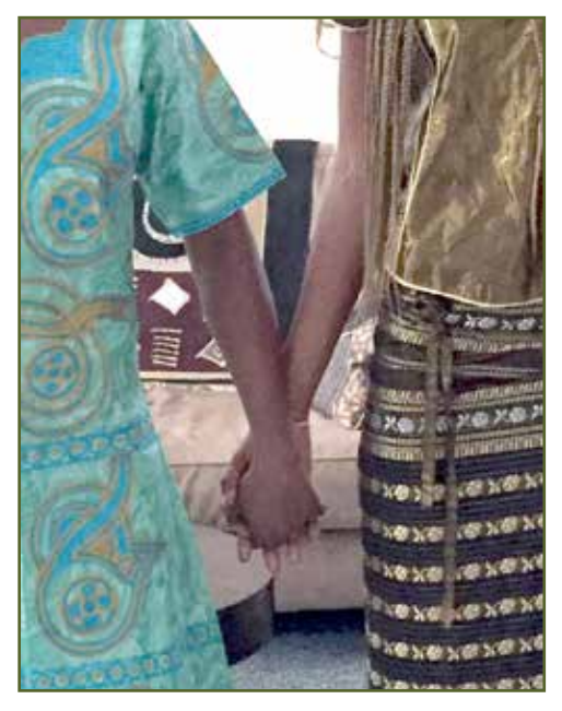
LifeWay House Women Celebrating Their Cultural Holidays and Traditions

We have established a small college fund, made possible by our generous donors, and are thrilled to be able to fund college courses for some of our women. We see their hopes and dreams come to fruition every day, which is especially impactful when remembering the horrors they have suffered.