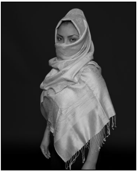
New York's New Abolitionists Portrait

"When I was forced into prostitution, I did not know what 'trafficking' was. My trafficker stole my childhood. I want to make sure that no girl ever again suffers what I went through. I hope someday that I can show my face without fear for my safety or my family's, but until then I will speak out until I have no voice left."